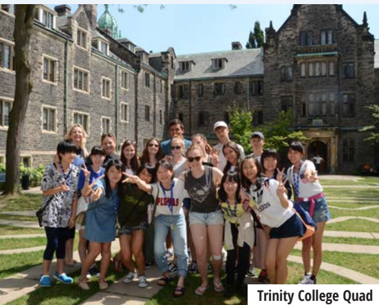
Trinity College Quad

Trinity College of the University of Toronto is not affiliated with the CISS summer programme.