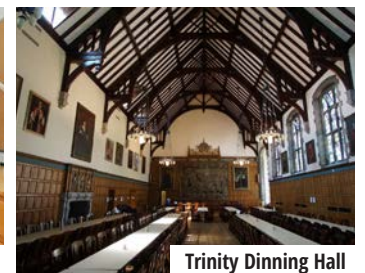
Trinity Dinning Hall